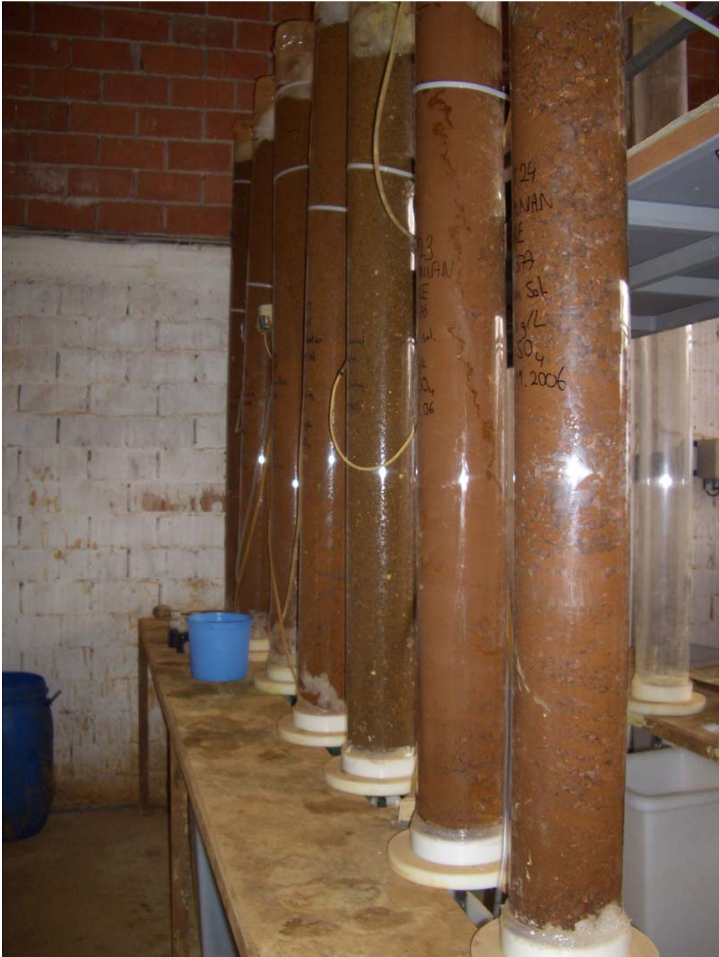
Fig 2 Acoje Ore Column tests, Turkey